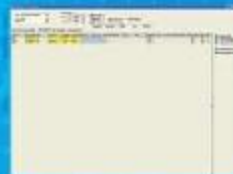
Generate Standard Report